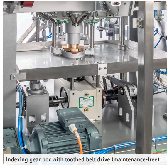
Indexing gear box with toothed belt drive (maintenance-free)